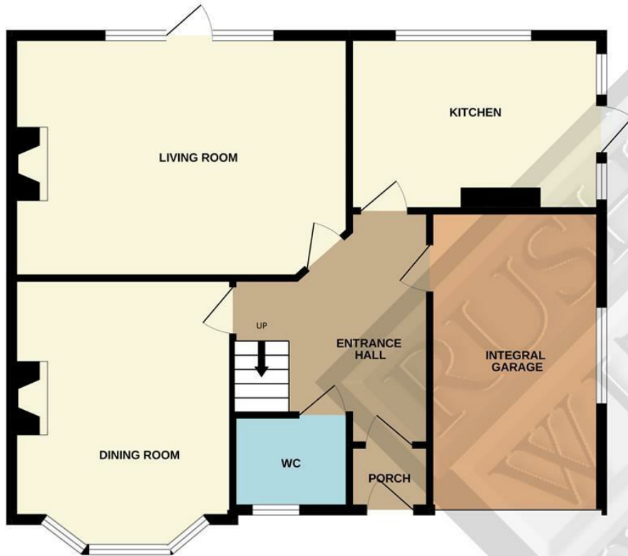
GROUND FLOOR 815 sq.ft. (75.7 sq.m.) approx.