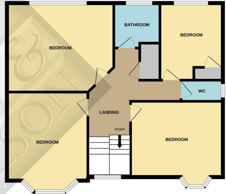
1ST FLOOR 837 sq.ft. (77.7 sq.m.) approx.